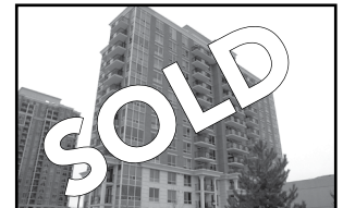
1103 Leslie Street, Unit 309