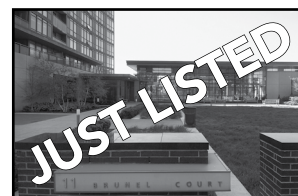
11 Brunel Court, Unit 3607