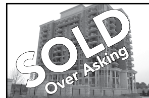
1103 Leslie Street, Unit 506