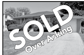
11 Robson Place