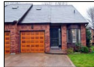
Biffis Court SOLD