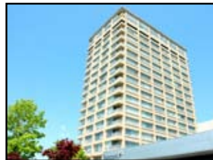
797 Don Mills (2 bed / 2 bath) SOLD