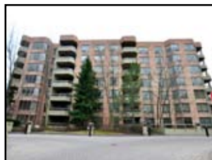
1200 Don Mills Road (1 bed / 1 bath) (Acted as Buyers agent)