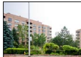
1210 Don Mills Road (1 bed / 2 bath) (Acted as Buyers agent)