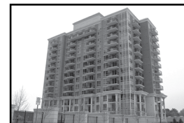
1103 Leslie Street (2 bedroom/2 bathroom)

If you are thinking of making a move, call Gillian today at 416-222-8600