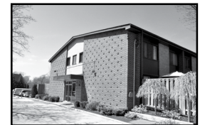
Three Valleys Drive (3 bedroom Condo Townhouse)