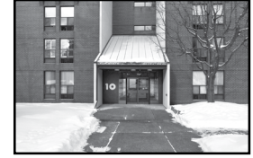
10 Fashion Roseway (3 bedroom/2 bathroom)