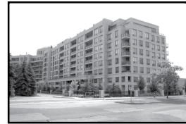
205 the Donway West (2 bedroom/2 bathroom)