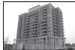
1103 Leslie Street (1+1 bedroom/1 bathroom)