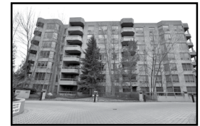
1200 Don Mills Road (1 bedroom/1 bathroom)