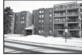
10 Fashion Roseway (2 bedroom/2 bathroom)