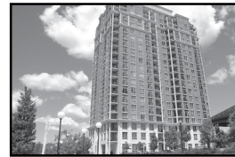
1101 Leslie Street (1+1 bedroom /1 bathroom)